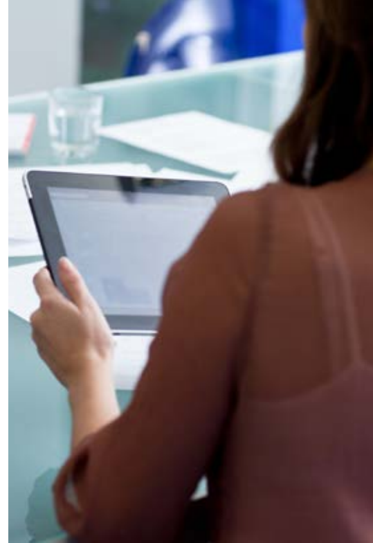
Figure 1. Alcatel-Lucent OpenTouch Suite for SMB portfolio

The portfolio is reliable, open and standards-based. Alcatel-Lucent OpenTouch Suite for SMB is modular at every level – from communication suites and software licenses to communication servers and networking infrastructure that meet customers' exact requirements. You can buy the portfolio with a hardware warranty and a variety of services, evolving from a simple maintenance contract to a complete system with new applications and technology. Alcatel-Lucent OpenTouch Suite for SMB is future-ready, based on a powerful and flexible IP communication server, OmniPCX™ Office Rich Communication Edition (RCE) using standard protocols and offering a number of powerful features.